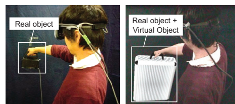
Fig. 2 Experimental scene