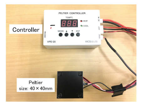
Fig. 1. Device for presenting thermal

In our experiments, hot and cold stimulations are presented by using Peltier devices (size: 40 \times 40 mm) and temperature controller sets (VPE-20-5 V, VICS Ltd., Fig. 1). Considering the stability of the temperature stimulation, we sat the devices on a table and asked subjects to put the inside of their forearms on them. Three devices were set 100 mm apart in a row on the table. Each device had contact with the wrist, the center, and the elbow spot of the forearm (Fig. 2). Also, two pillows were prepared for each subject's wrist and elbow to hold and stabilize his or her forearm.