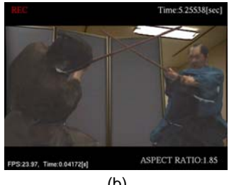
Figure 2. Superimposing various motion data into real scene (a) Editing various motion data (b) Superimposing 3D Video into scene of real world

build-in video camera what is moved while playing 3D Video as action data and superimposing them onto the scene of real world in realtime.