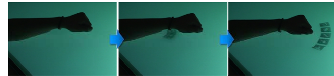
a) Display the menu by placing the forearm

Figure 1 shows the interaction with the menu appearing from the forearm. As with Bailly et al. [5], we used a pie menu so that the menu items are located inside users' range of hand motion and users can easily access each menu item. The users can select an item by the touch gesture. To hide the menu, users can simply lift their forearms up from the tabletop display on their elbows or select the "hide" menu located in the top menu. The menu will then be stored in the forearm